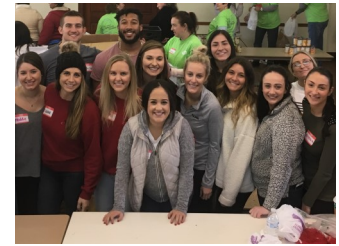
A team of enthusiastic volunteers from ALKU join us for the first time at the Christmas meal distribution.

AHS Football has their "last chance workout" unloading trucks at the Thanksgiving meal distribution before the big game. Thanks Warriors! AHS Basketball help in December. (not pictured)