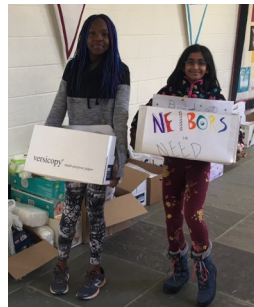
Andover's West El collect food for NIN at their Jingle Bell Walk.

Many thanks to the volunteers that help us set up the day before distribution!