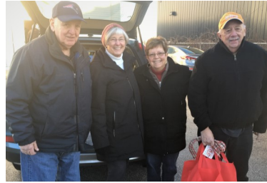
Regency at Methuen donates 50 Christmas meals to be delivered to clients. Thank you!