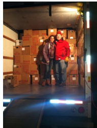
South Church generously donated 243 Thanksgiving dinners.

AHS Football has their "last chance workout" unloading trucks at the Thanksgiving meal distribution before the big game. Thanks Warriors! AHS Basketball help in December. (not pictured)