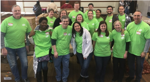
Pfizer, a long time partner of Neighbors in Need volunteers at holiday meal distribution.

On Tuesday, November 20th and Thursday, December 20th we distributed over 1,300 meals for Thanksgiving and 1,000 meals for Christmas to families in need in Greater Lawrence. We are so thankful to all of our dedicated donors and volunteers who made these events possible!